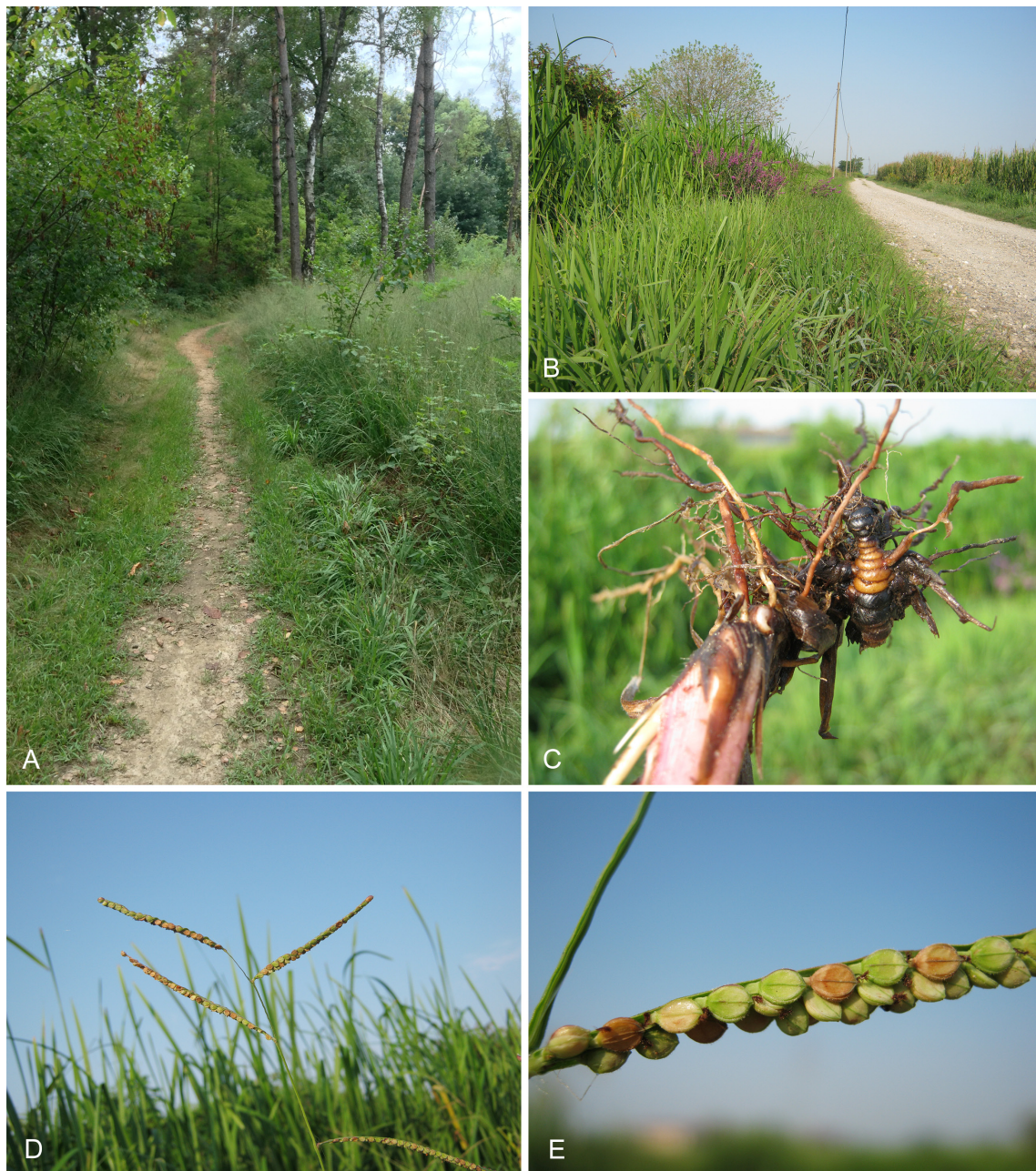
Fig. 1. Paspalum thunbergii in Italy. – A: forest path in Boscaccio; B: roadside ditch in Mortara; C: rhizome; D: inflorescence; E: spikelets. – A: Boscaccio, photographed in August 2015 by Guido Brusa; B–E: Mortara, photographed in August 2015 by Nicola Ardenghi.

pubescent, especially along the margins (vs acuminate at the apex, with long-ciliate margins). Moreover, P. thunbergii typically has upper glumes that are 3-veined with a very prominent central vein and marginal lateral veins (vs 5–7-veined upper glumes in P. dilatatum ). Also, both species are ecologically rather different (see below). Paspalum thunbergii and P. dilatatum locally have likely been confused in Italy or elsewhere in Europe. However, a revision of herbarium specimens of the latter in some herbaria (BER, BR, HBBS, GENT, MSNM, PAV and TO; acronyms according to Thiers [continuously updated]) only yielded one supplementary record of P. thunbergii (see specimens examined).